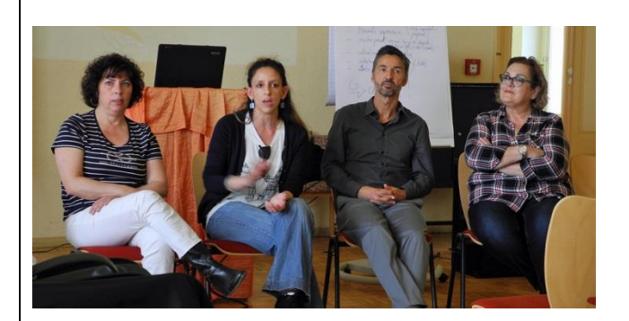
Summary of the conference & "Farewell" at Bayer-ischer Bahnhof

In the General assembly the results of the discussion groups were presented and discussed. It also offered the opportunity to address topics of concern for the network.